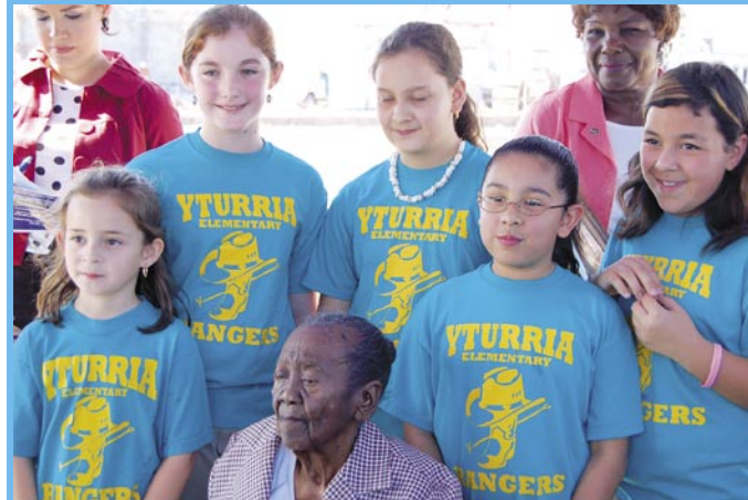
Mittie A. Pullam Elementary