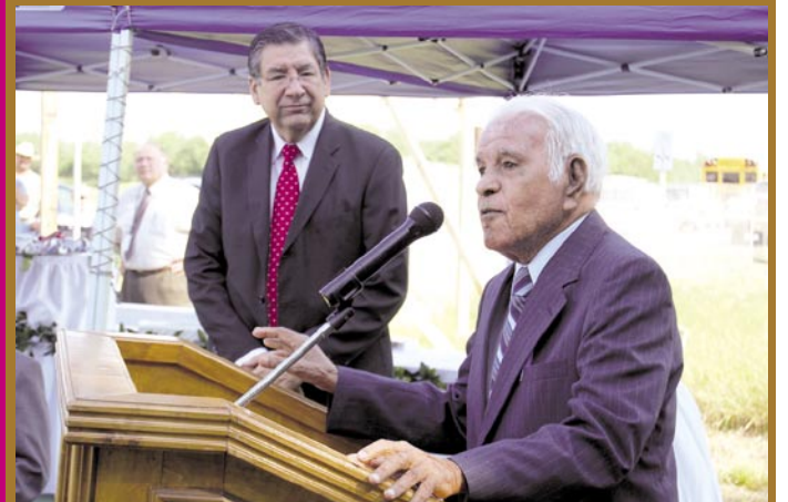
Edward Manzano, Jr. Middle School