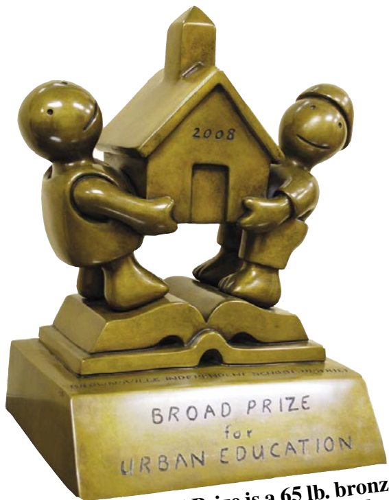
The Broad Prize is a 65 lb. bronze statue. It was created by Tom Otterness, a renowned American sculptor.

The Broad Prize is an annual award that honors large urban school districts that demonstrate the strongest student achievement and improvement in America while narrowing achievement gaps between income and ethnic groups.