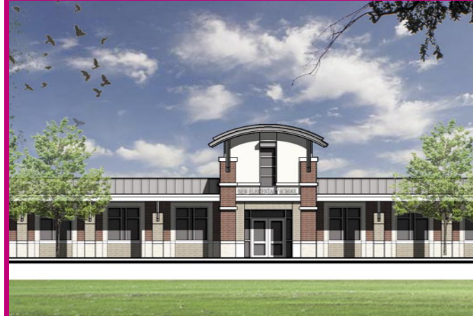
Thomas W. Keller Elementary