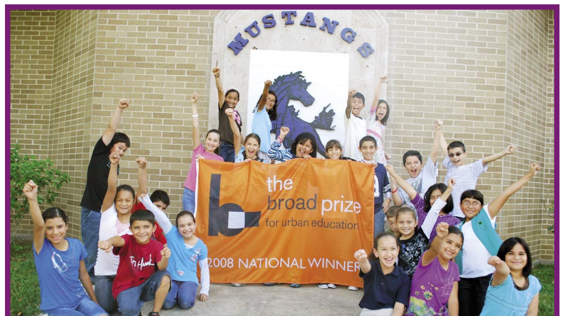
WE DID IT: Gonzalez Elementary students share their excitement over the district's recent Broad Prize Award. Each BISD school will receive a flag and banner to display.