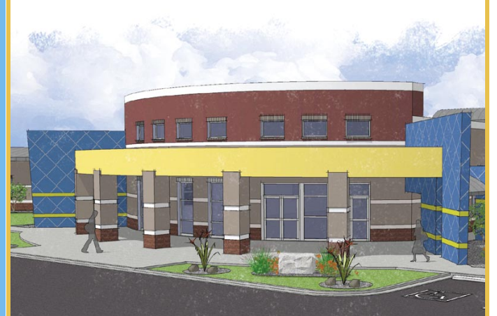
Raquel Peña Elementary