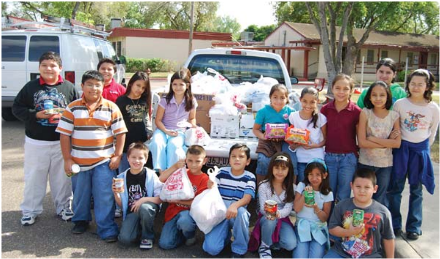
Canales Elementary students generously contributed to the district's Thanksgiving Food Drive. BISD students, parents and employees donated 26 truckloads of food to assist their local neighbors in need.