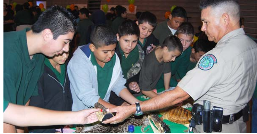
Lucio Middle School's Career Day provided students with presenters and information on careers for tomorrow.