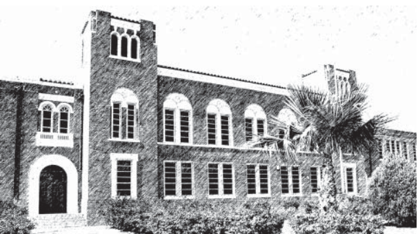
The new BISD Museum and James R. Murphy Center are located in the Central Administrative Building Complex on Palm Boulevard.