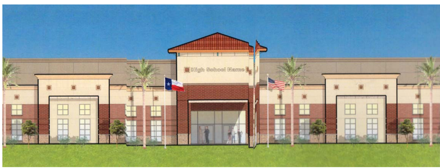
Front exterior elevation of the new high school including the front entrance, library and administrative offices.

I n a matter of months, Brownsville ISD is scheduled to begin the simultaneous construction of five new campuses destined to change the landscape of our entire community. Architects are putting the final touches on designs for one new high school, one new middle school, and three new elementary schools.