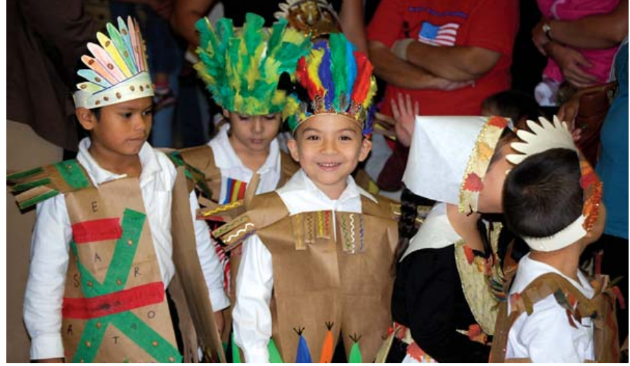
Castañeda Elementary pilgrims and Indians gathered together in the spirit of Thanksgiving.