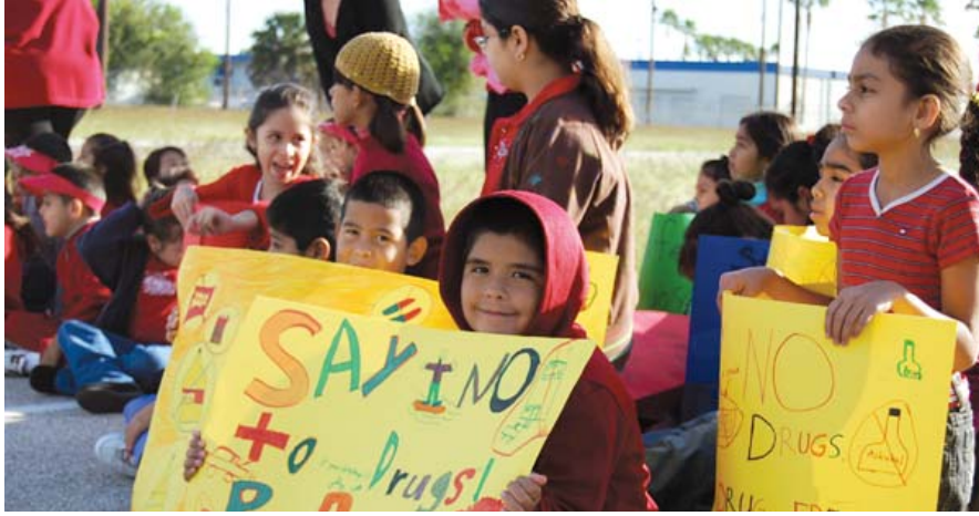
A Red Ribbon Parade held by Morningside Elementary served as a reminder to live drug free.